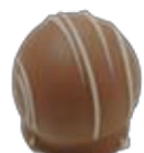
Truffle Chai Vanilla