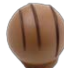
Truffle Lemongrass Curry