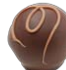
Truffle Peppermint 55%

This is only a sample of our wide chocolate assortment.